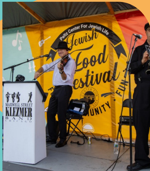
Music & Entertainment