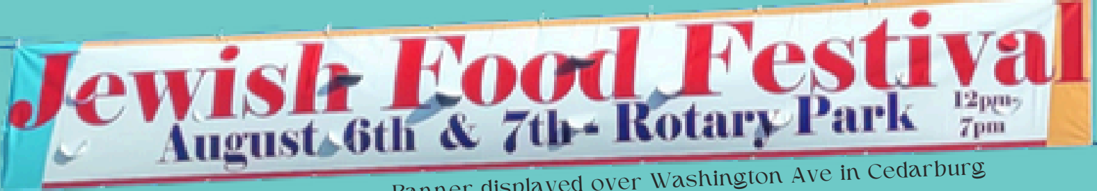
Banner displayed over Washington Ave in Cedarburg

A Project of the Peltz Center for Jewish Life