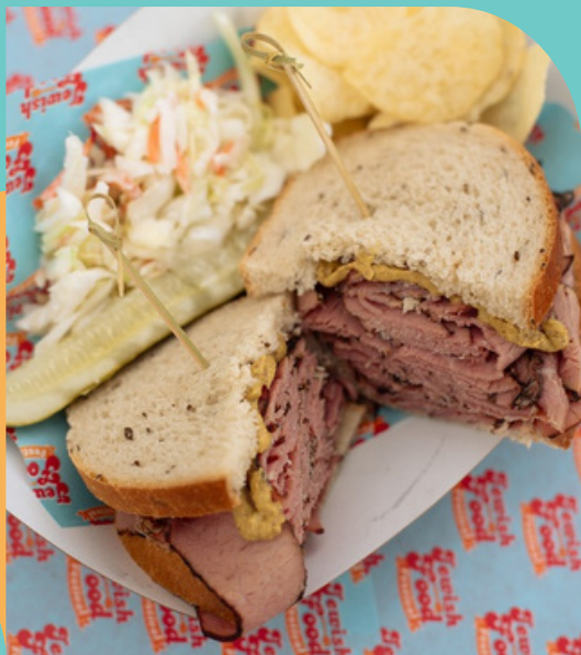
Jewish Ethnic Foods

The Jewish Food Festival combines varied entertainment elements to cater to a diverse crowd of all ages and backgrounds.